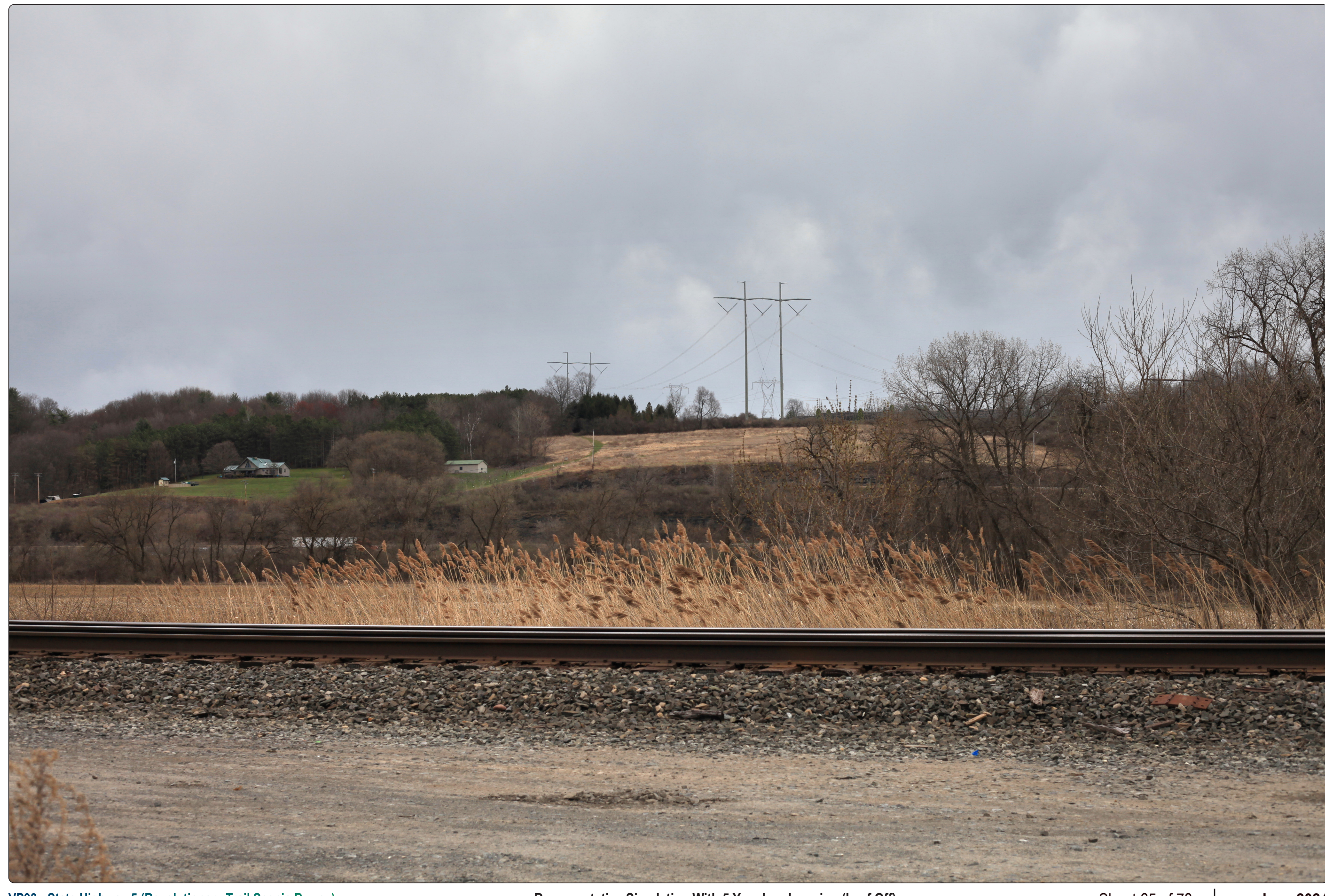
VP93 - State Highway 5 (Revolutionary Trail Scenic Byway)