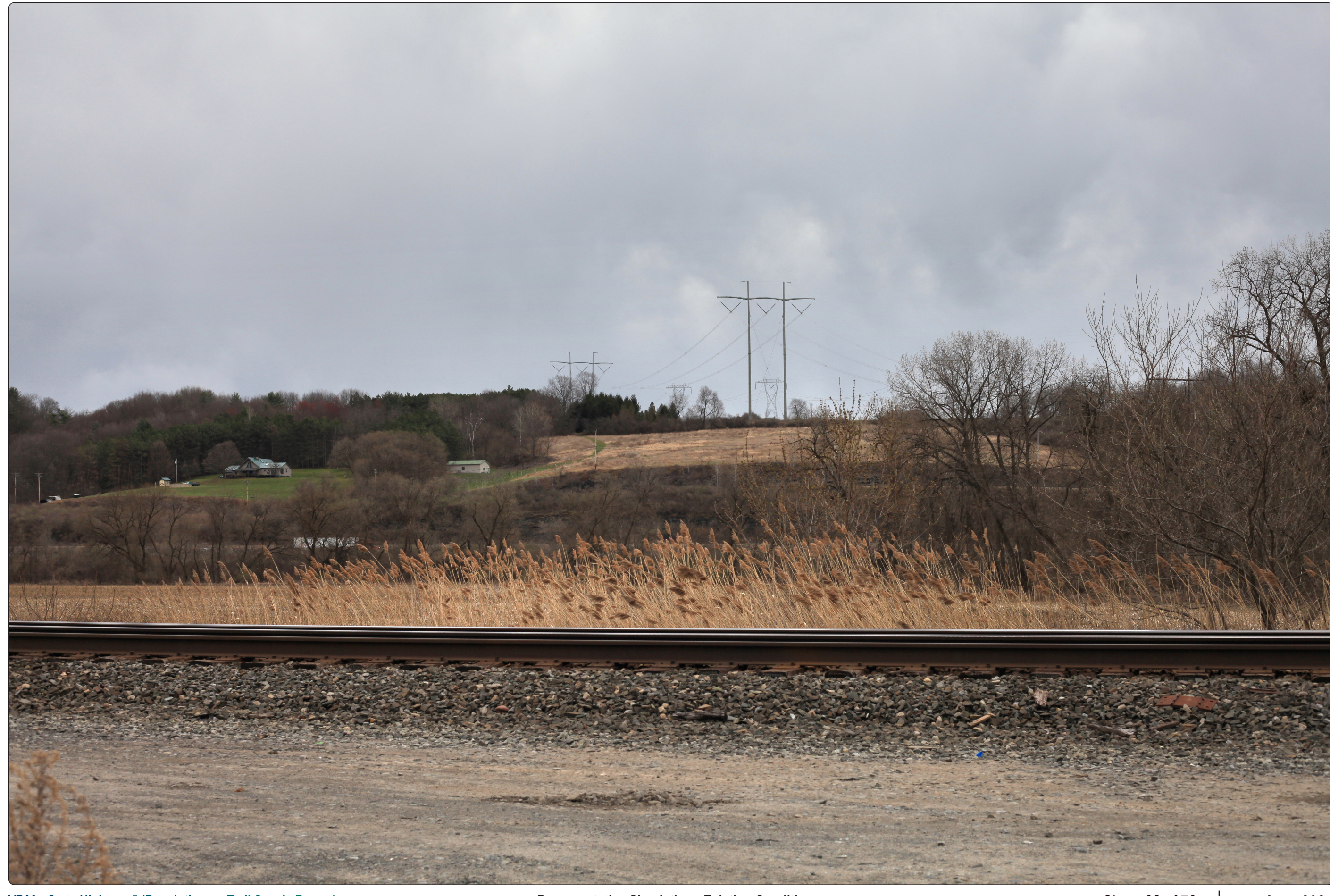
VP93 - State Highway 5 (Revolutionary Trail Scenic Byway)