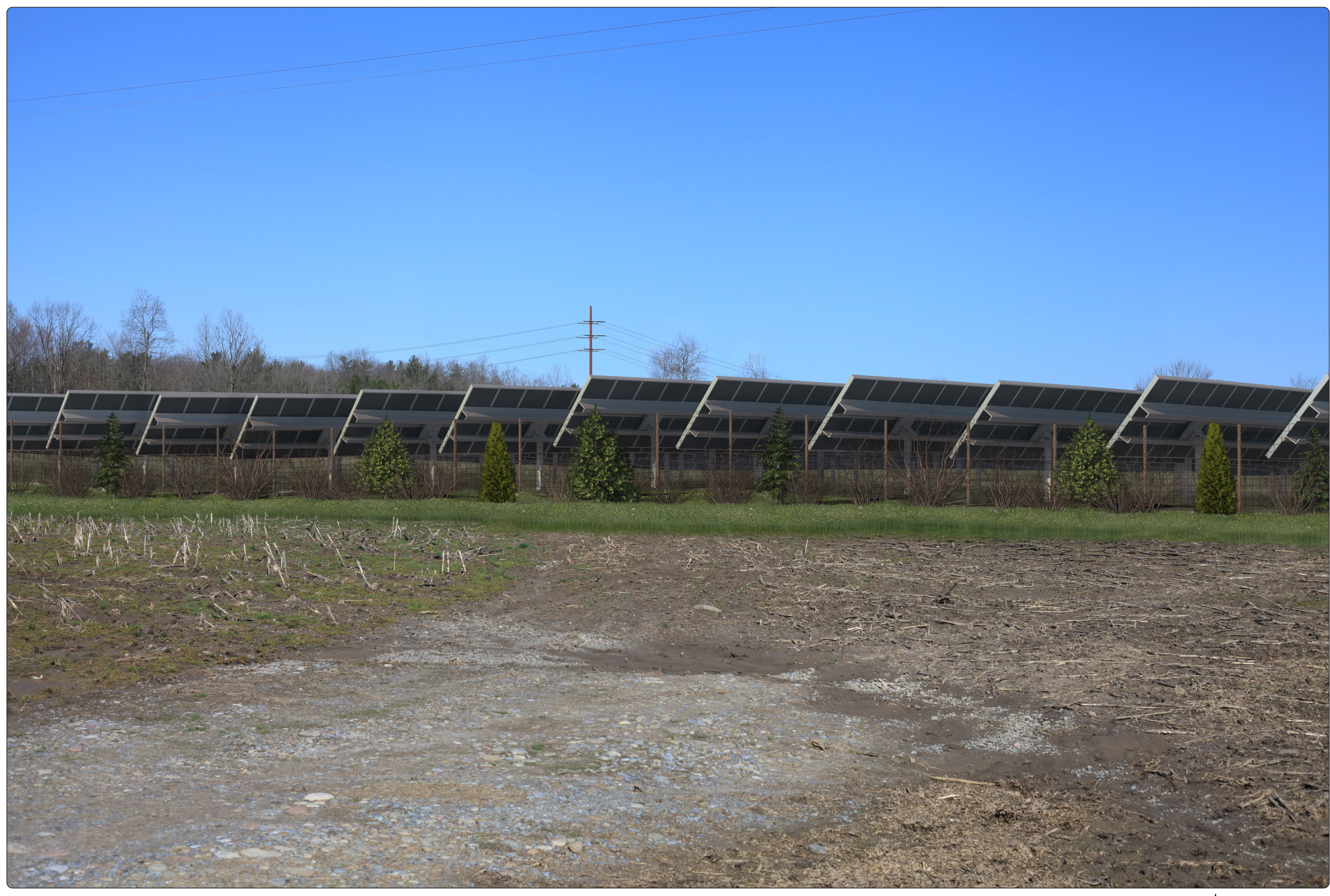
VP68 - Ingersoll Road (Montgomery County Scenic Byway)