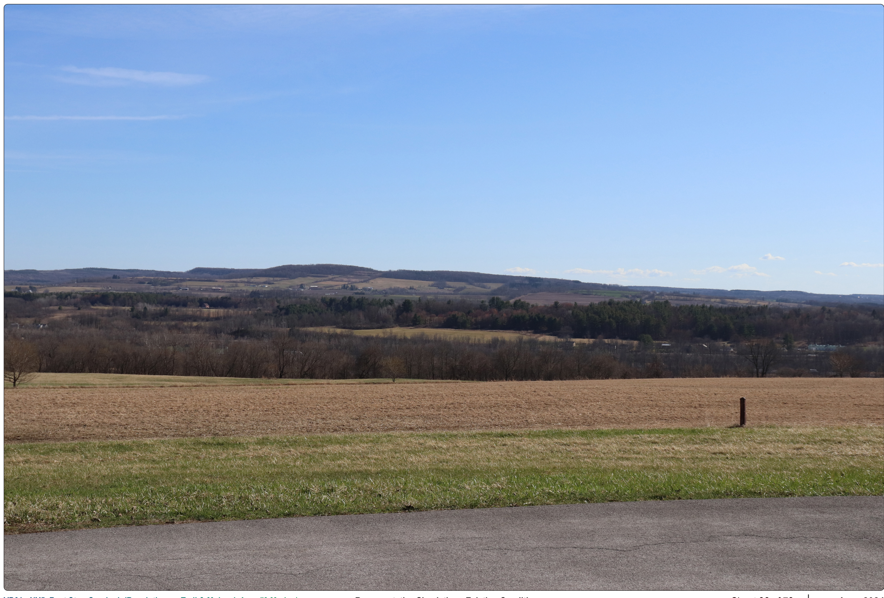
VP61 - NY5, Rest Stop Overlook (Revolutionary Trail & Mohawk Area #3 Marker)