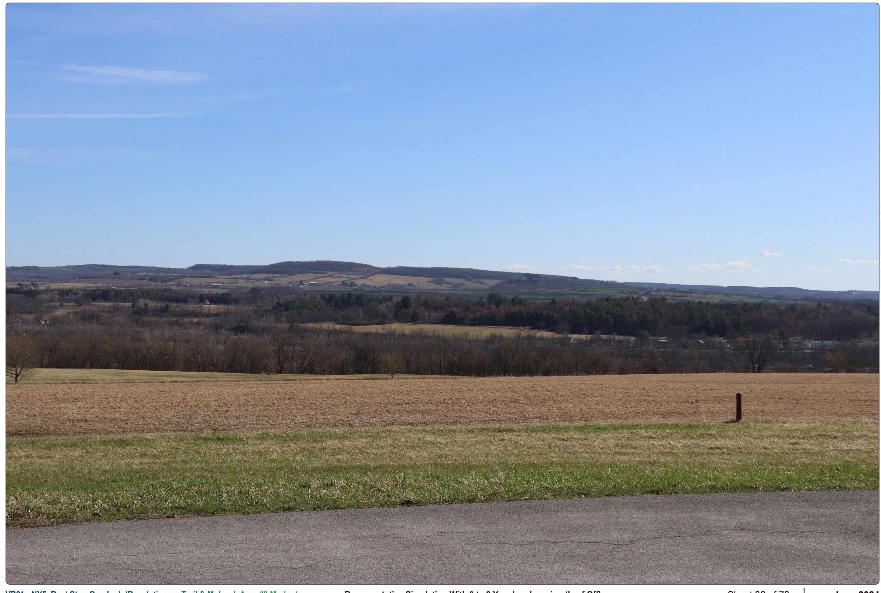
VP61 - NY5, Rest Stop Overlook (Revolutionary Trail & Mohawk Area #3 Marker)