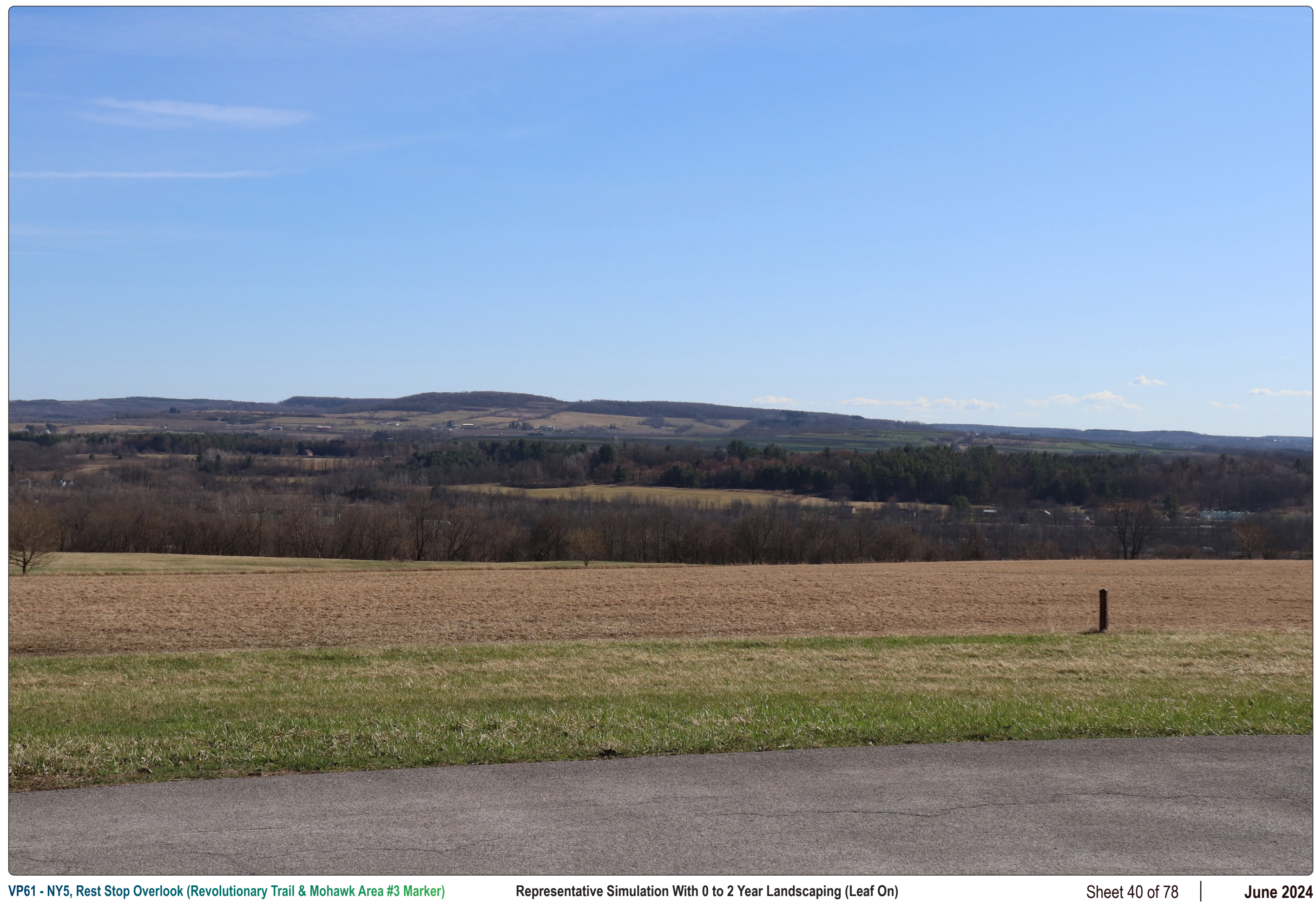
VP61 - NY5, Rest Stop Overlook (Revolutionary Trail & Mohawk Area #3 Marker)